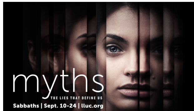
Myths The Lies That Define Us

What we believe, we become. Throughout Scripture, God highlights the incredible power of positive belief in shaping our lives. That's why he consistently urges his followers to believe that what he says is true.