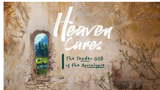
Heaven Cares The Tender GOD of the Apocalypse

Revelation. Merely mention the book and conflicting emotions erupt. Delight! Distress. Courage! Cowardice. Hope! Horror. No other Bible book creates such responses. "Revelation?" Doesn't that mean an unveiling? "The revelation of Jesus Christ?!" Doesn't that promise comfort and assurance? Yet, simply perusing the book creates more confusion than clarity, more fear than faith. Could it be that we have missed something—something compelling and profound? Could it be that lost in beasts and chaos, confusion and destruction, we have missed the tender God of the apocalypse? The God revealed in Jesus? Blow the dust off the book. Crack open its pages. Pray. And steel yourself to encounter ... the wounded Lamb. Jesus. The One who cares about you!