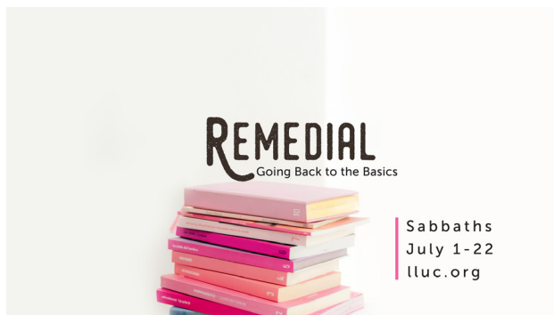
Remedial Going Back to the Basics