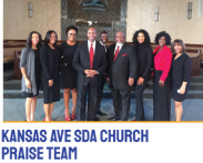
KANSAS AVE SDA CHURCH PRAISE TEAM